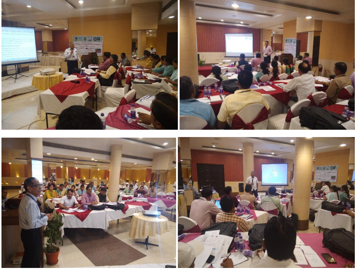
Exhibit-6: Lecture /Discussion on Day-3