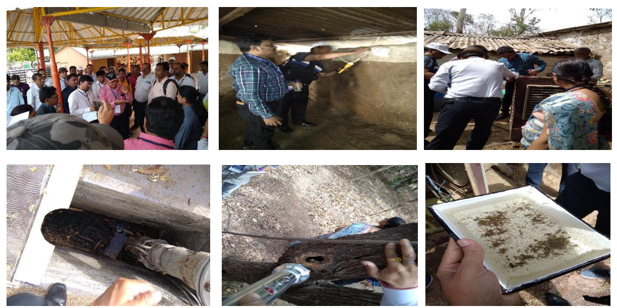
Exhibit-8: Photographs of Field visit at Sair Sapata, Bhopal Training part - 2: Legal perspective to the development of IVPM Training Materials

tools (Ladle, Enamel bowl, Pipette, Larval vials, larval nets, Aspirators, Torch, paper cups with nets covers, Cotton wool, a pencil, a notebook, a bag to put all material etc.).