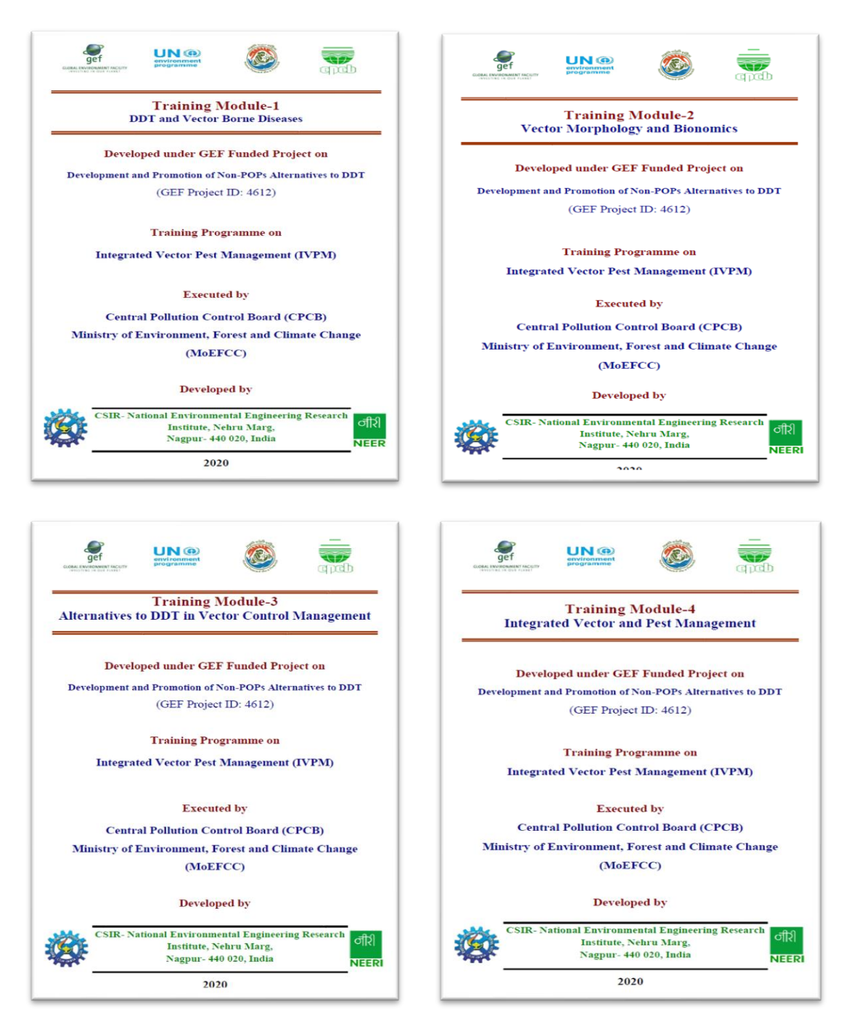
Facsimile of Training Modules 1 to 4

Diseases and non-insect borne diseases, module 2 is dedicated to vector morphology and bionomics, module 3 is dedicated to alternatives to DDT in vector control management and module 4 is dedicated to integrated vector & pest management. He requested to all the participants to provide suggestions/ comments and on how to make these training modules more usable/ effective.