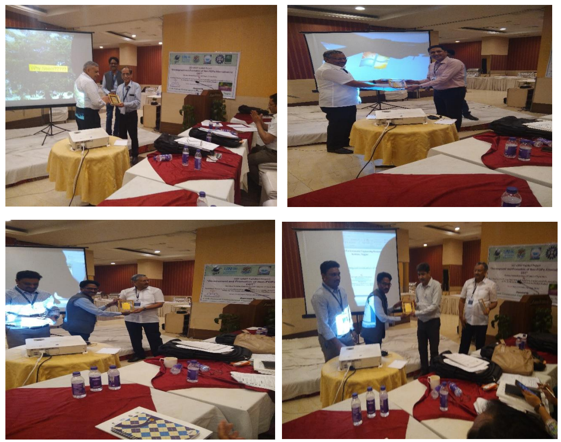
Exhibit-7: Memento presentation to experts/ resource persons

mosquito breeding places. Various types of equipment for collection, various types of breeding habitats, and the resting posture of mosquitoes were discussed. The session of day-3 was concluded with a memento present to the subject experts and other resource persons for their contribution during the training ( Exhibit-7 )